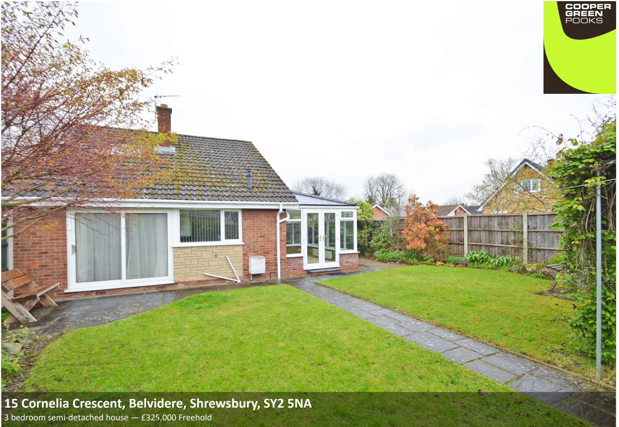
15 Cornelia Crescent, Belvidere, Shrewsbury, SY2 5NA

3 bedroom semi-detached house — £325,000 Freehold